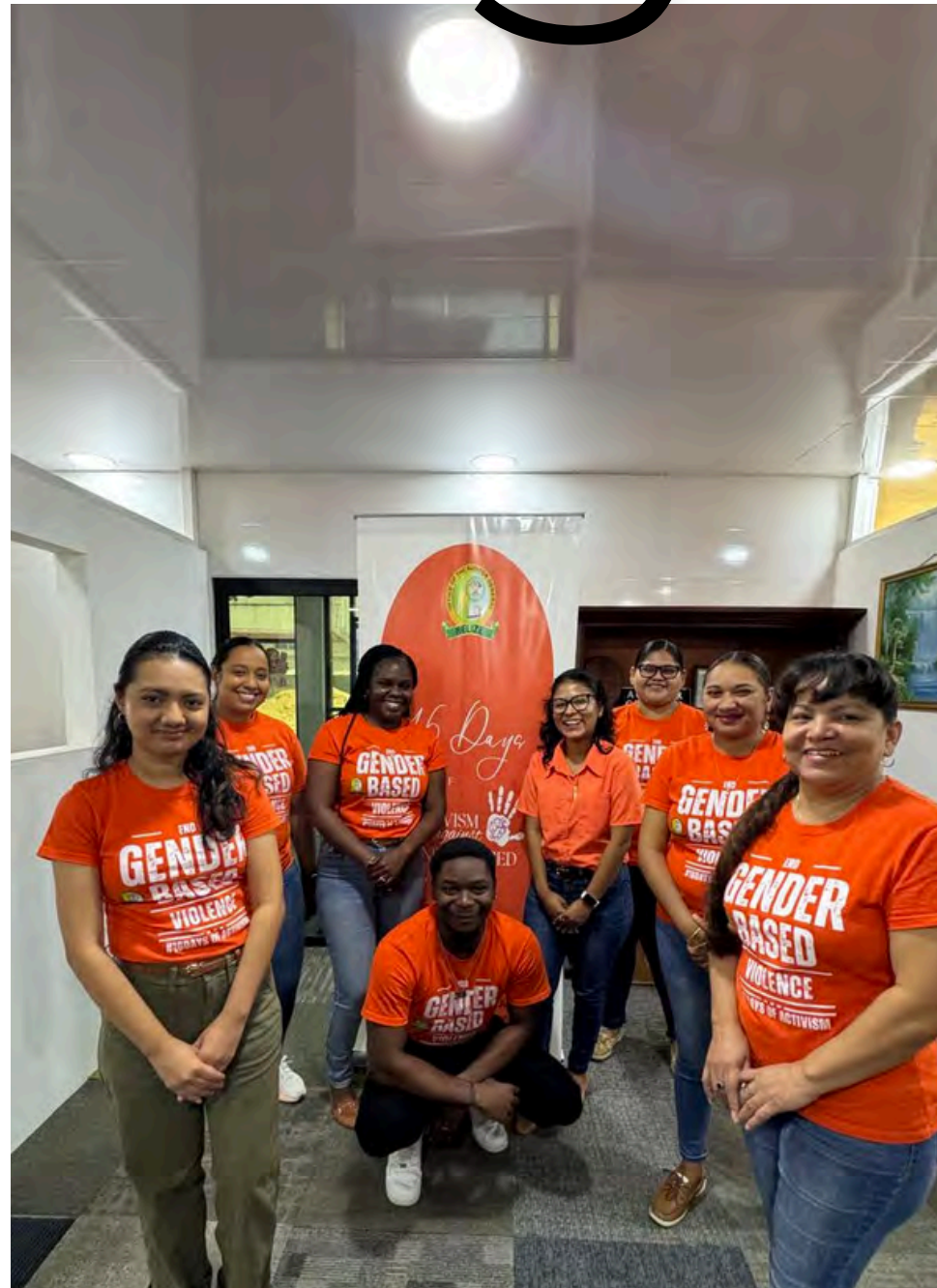
The OAGB says no, to gender based violence.