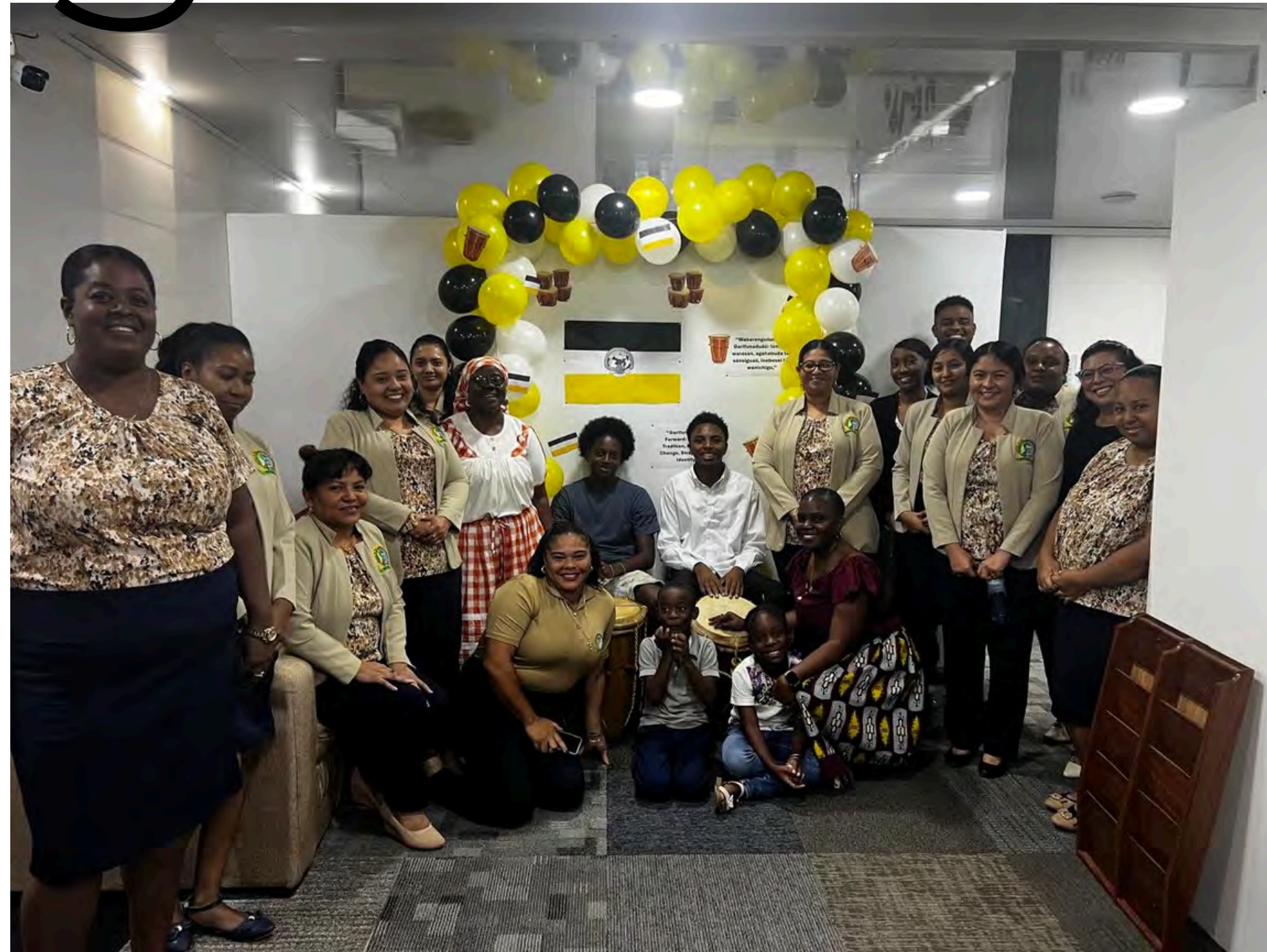
Garifuna Settlement Day Celebration.